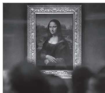
The Mona Lisa

And what happened to the Mona Lisa? The painting was shown all over Italy for two years. In 1913, it went back to the Louvre in Paris. It is still there today.