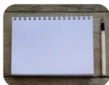
a drawing book